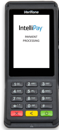
Verifone V400C Terminal