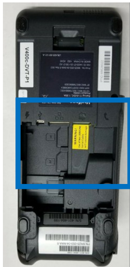
Bottom (back) of V400C

This DLL will Manage and Open the connection to the V400, The responses are returned to an event handler defined below.